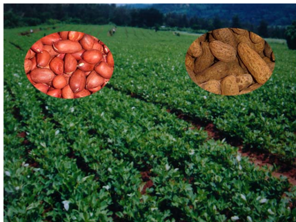
Ubunyobwa HGN 17