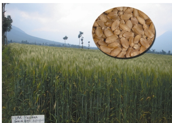
Ingano za Musama