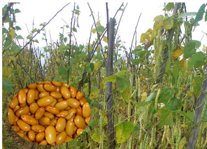
Ibishyimbo bishingirirwa G 2331