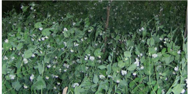
Amashaza - Nyagashaza